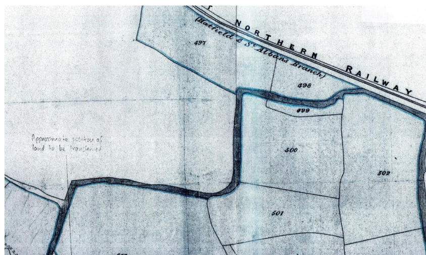
1894 Conveyance plan showing Hill End Lane